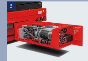
Hydraulic and electric system